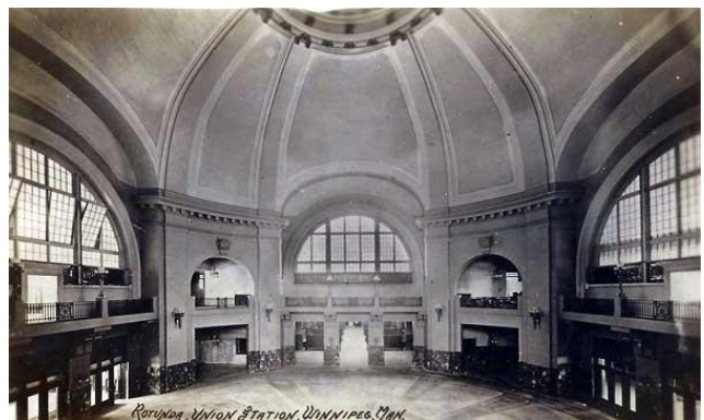
Rotunda, Union Station, Winnipeg, Man.